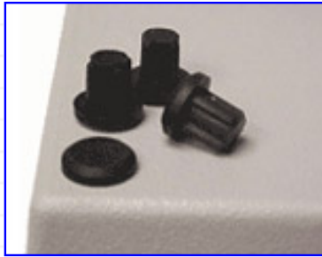
Non-Skid Feet (P/N 51) RETURN TO TOP