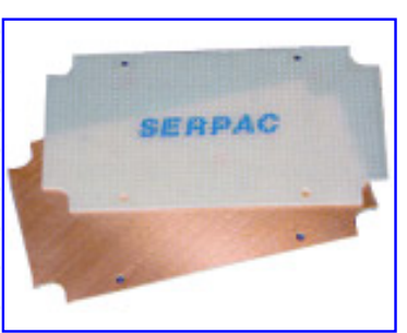
Grid and Clad Protoyping Boards Pocket Clip (P/N 350, 450)